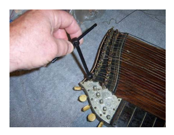
Day 2: Removing Strings & Gears