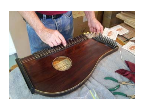
Day 11: Installing Strings