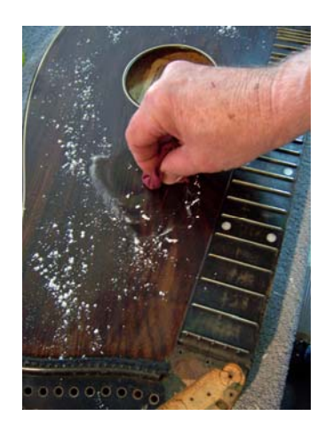
Day 8: Polish Top & Ebonize the Fingerboard