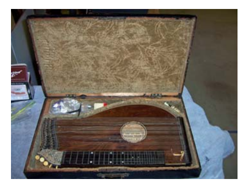
Day 1: Assessment