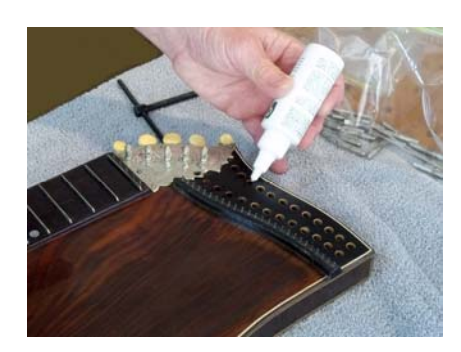
Day 10: Reinstalling the Tuning Pins