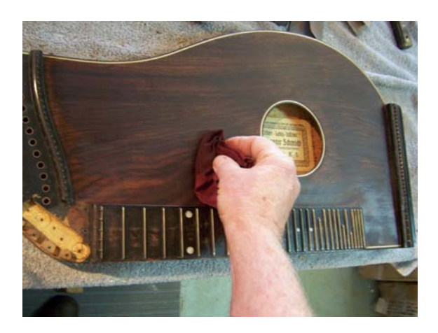
Days 4-7: Tung Oil Varnish

Now with the top and sides smoothed out, and the patches touched up, I spent several days applying a tung oil varnish. This type of finish can be applied only once a day. It needs to dry around 24 hours between coats. I applied four coats.