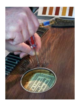
Days 3: Resetting Screws, Patching, Cleaning